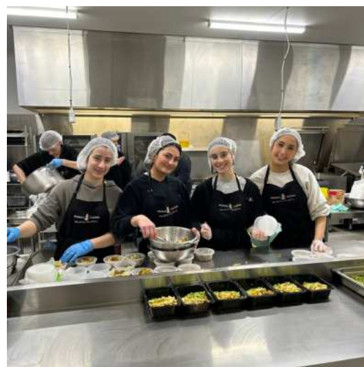
STUDENTS FROM ST MARY'S COLLEGE