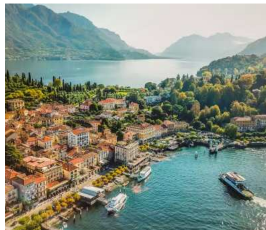
THE ITALIAN VILLEGGIATURA