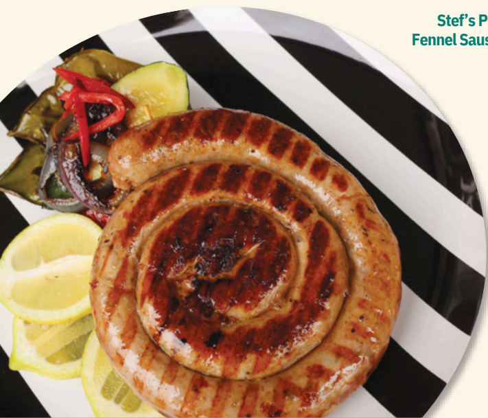
Stef's Pork & Fennel Sausages