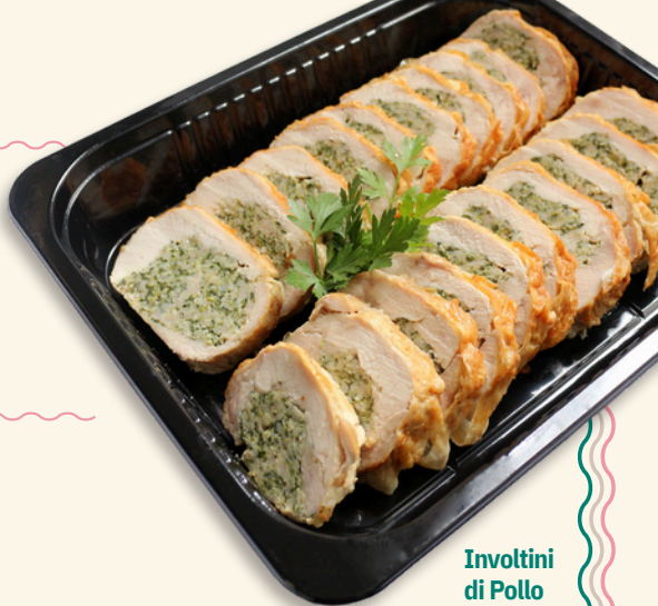
Involtini di Pollo