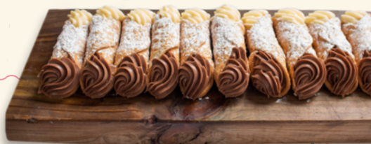
Cannoli With Custard