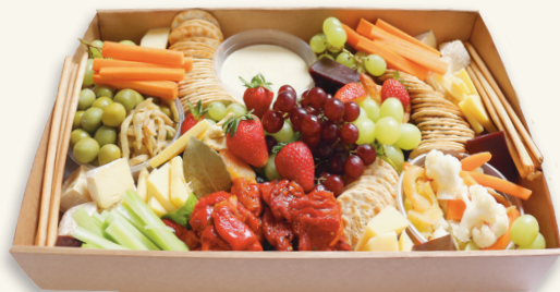
Cheese & Greens