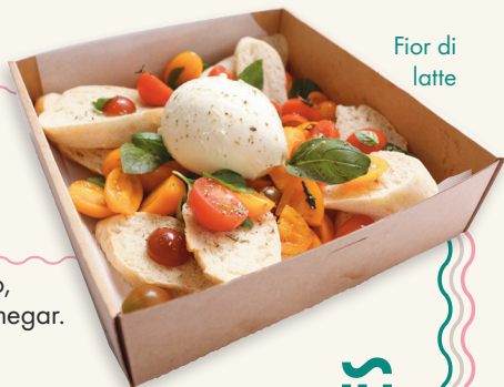
Fior di latte