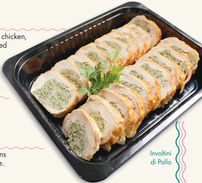
Involturni di Pollo