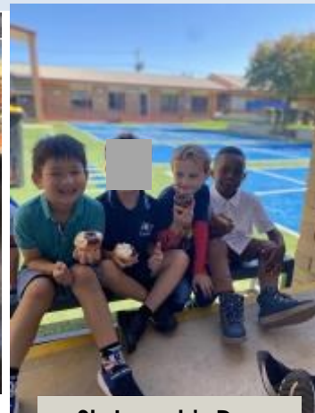
St. Joseph's Day