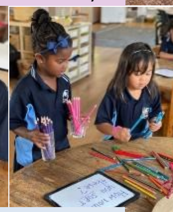
Literacy and Numeracy Groups