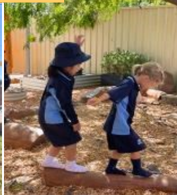
Exploring the new Pre-School yard