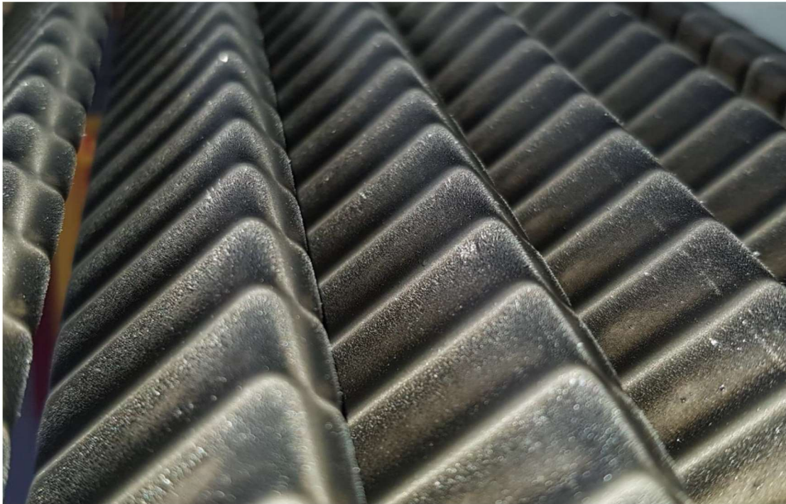
Mag-Shield from hydraulic tank of EX5600 with long-term contamination problems.

Following installation of the Mag-Shields, the frequency of contamination sensor alarms and contamination sensors requiring physical cleaning has been reduced by 75%. Contamination removal post failure will also be greatly improved. Engineering at the trial site reported the following: "Oil analysis results were inconclusive. As shown by the image (below) there was a consistent covering of extremely fine particles on all surfaces, there was also a significant build up on the edges of the screens in the lower flow areas. It also shows that particles of the size caught by Mag-Shields are not accurately reflected in oil sample reports. "