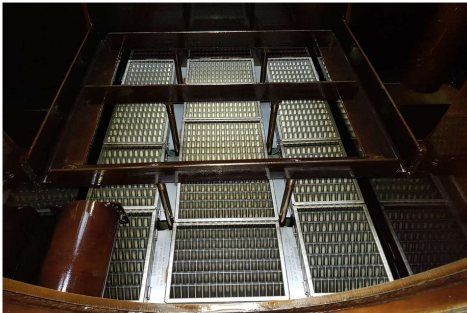
BAY6 Solutions Mag-Shield filtration system installed in the main hydraulic tank of a Hitachi EX5600 excavator.

The fleet operator reached out to BAY6 Solutions to provide a Mag-Shield magnetic filter solution for their fleet. The customer installed Mag-Shields on one of several problematic excavators that was experiencing numerous repeat failures. Contamination returning to the hydraulic tank from any component failure is immediately captured and held by Mag-Shields preventing the spread throughout the system. Following repairs, residual contamination is captured and prevented from recirculating.