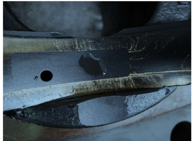
Scoring present on main pump components caused by contaminated hydraulic fluid, prior to Mag-Shield Installation