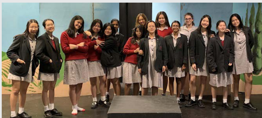
Year 10 – Literature, Culture, Revolution class