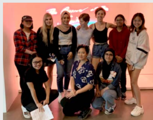
VCE Studio Arts class at ACCA