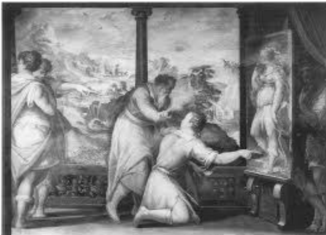
Photo: Apelles fresco by Giorgio Vasari, Casa Vasari, Florence

When Apelles put his art on show, the artist liked to hide behind his paintings in order to eavesdrop on people commenting about his skill. Apelles was a reasonable man. When a cobbler noted that Apelles’ rendering of a sandal was flawed, the artist recognised the man’s expertise and repainted it. Emboldened by the artist’s respect for his knowledge, the cobbler ventured to suggest the subject’s leg could also do with some correction. This was a step too far for Apelles who rebuked the cobbler, “ Sutor, ne ultra crepidam! ” -literally, “ Shoemaker! Not beyond the shoe! ”