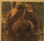
Tassies Buddy Chocolate, Fleece ALF6

13121 Midlands Highway, Epping Forest, Tasmania, 7211.