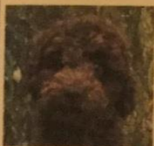
Tassies Lil Matilda Chocolate, Wool ALF4P