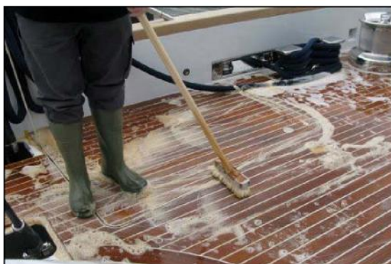
Clean with a light duty deck scourer