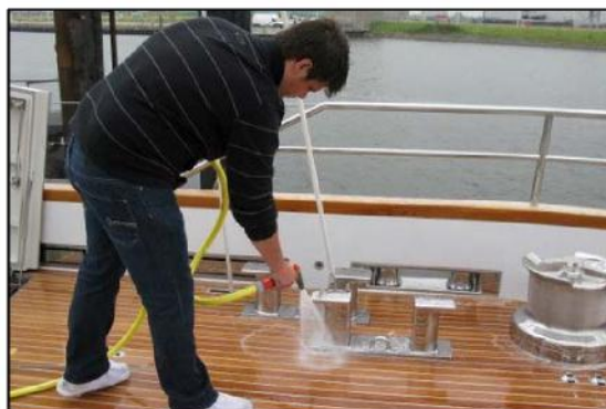
Remove the cleaner with (salt) water