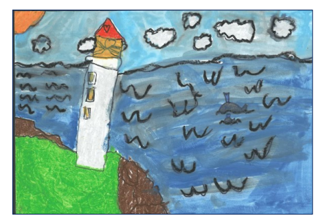
"It's exciting to live in the Festival State." - (Xian)