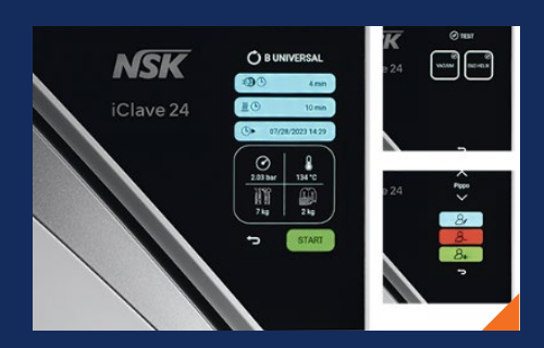
A next-generation experience

The internal ventilation system is durable, quiet, and ensures long-lasting, comfortable performance for the operator.