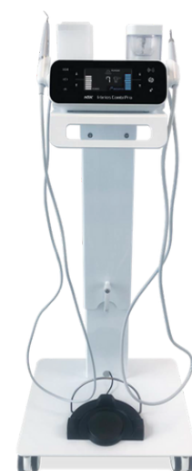
Above image showing overseas model of iCart Duo for VCP.