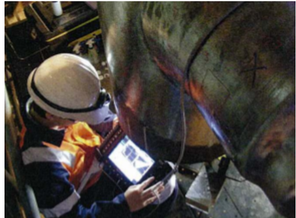
HRL engineer performing phased array ultrasonic testing

HRL engineers can use defect response simulation software to establish the best phased array scan program to optimise coverage, detect minimum-sized defects and reduce false calls.