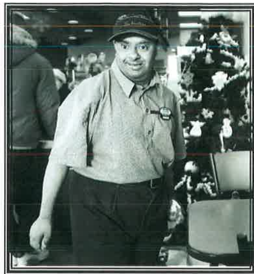
Al-Karim December 1, 1969 - January 28, 2015