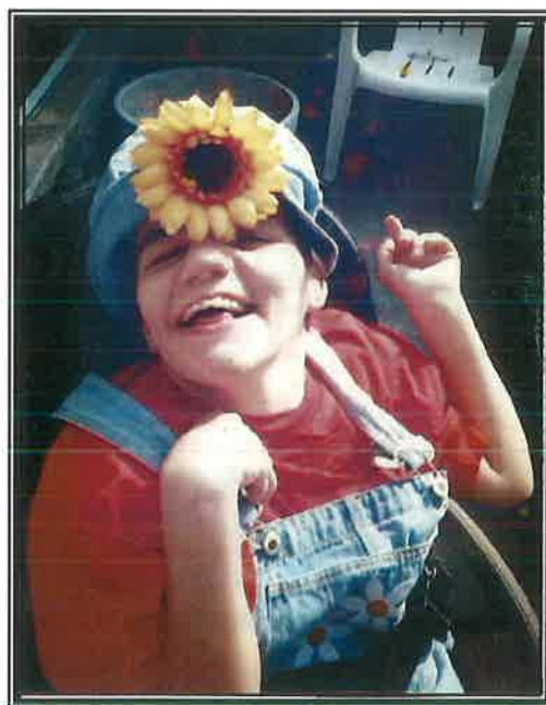
Virginia September 28, 1954 - March 27, 2015