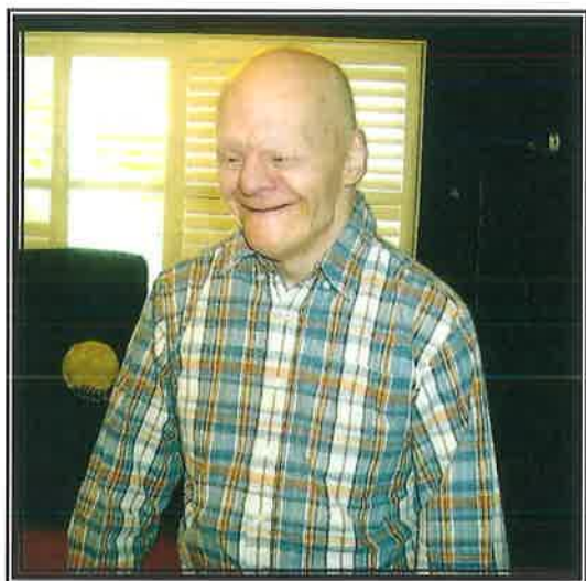
Joe September 15, 1944 - December 24, 2014