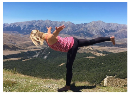
Number 8 of the Difficult Dozen - Arabesque

If you want to improve your balance, talk to your physiotherapist about developing a specialized program. They can do a thorough assessment to work out the most appropriate exercises to make the most improvements to your overall balance. This can be an important factor in preventing falls and injury, no matter your fitness level or age.