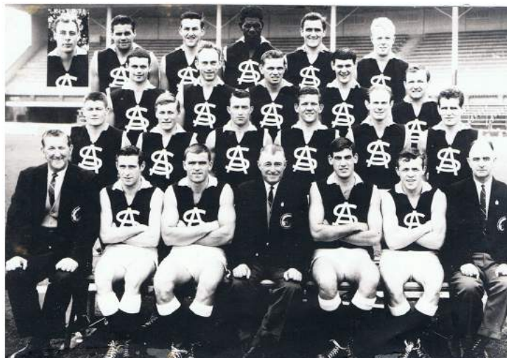
Our 1964 Premiership team

South Adelaide is a not-for-profit organisation and is a key community organisation. We work with many charities, schools and junior/amateur football clubs to build our community, develop youth and promote a healthy and successful lifestyle.