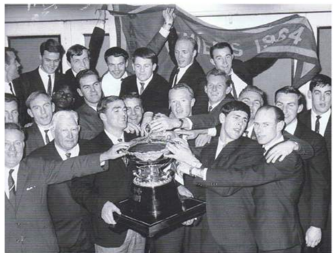
1964 Premiership celebrations