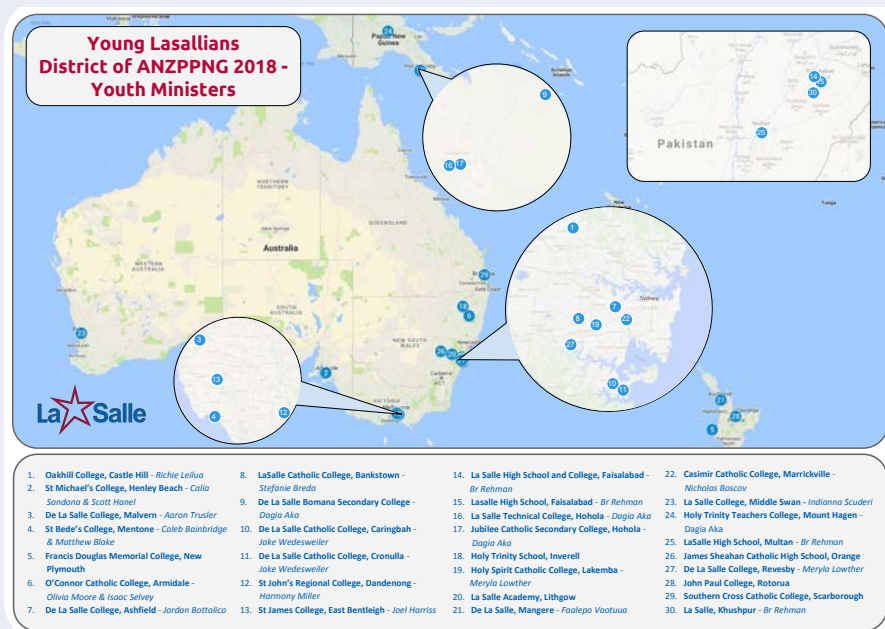
Map of Lasallian Youth Ministers 2018 - District of ANZPPNG