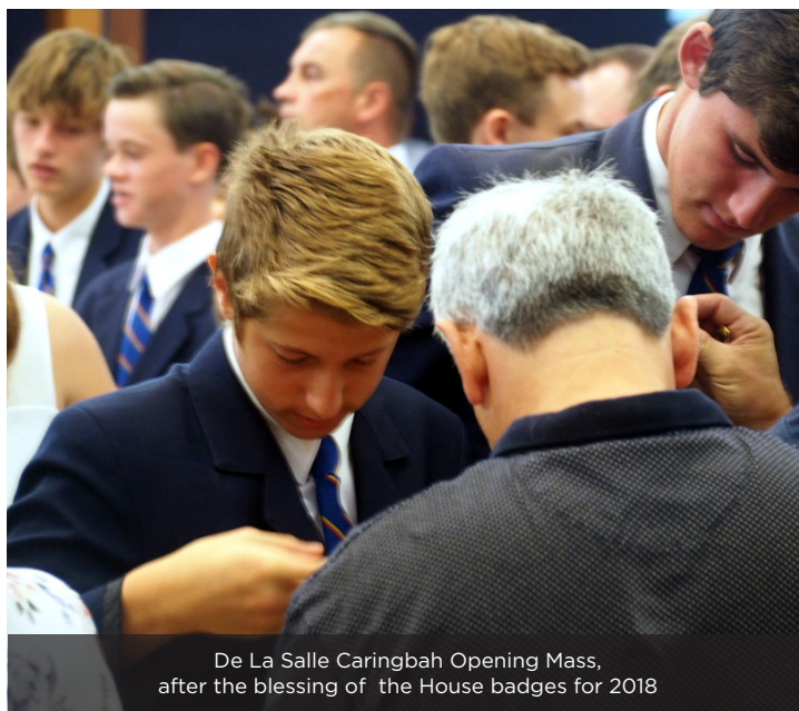
De La Salle Caringbah Opening Mass, after the blessing of the House badges for 2018