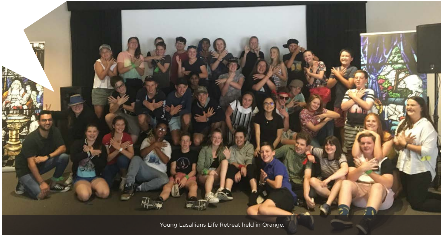
Young Lasallians Life Retreat held in Orange.