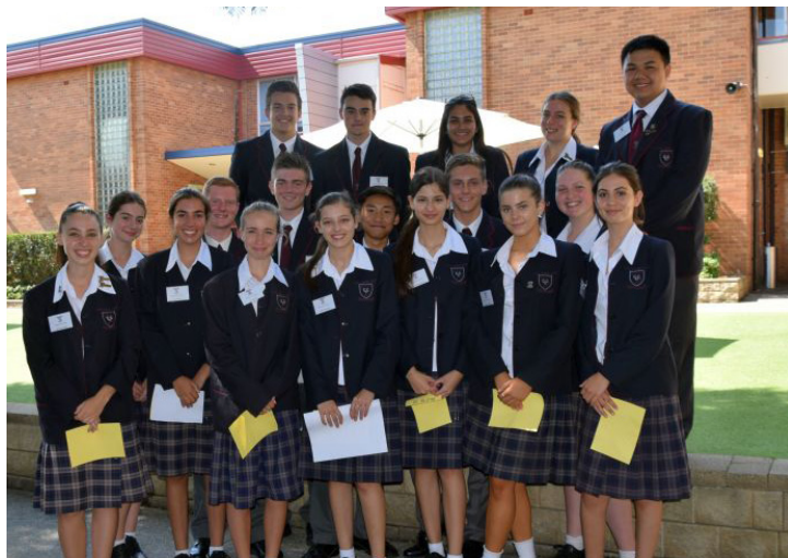
Students from Casimir Catholic College Open Day, 23 March.