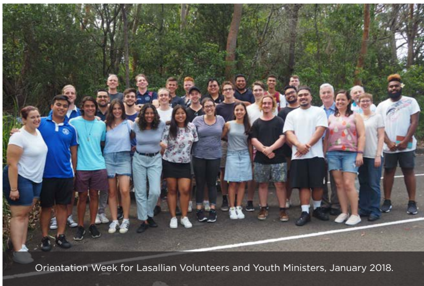
Orientation Week for Lasallian Volunteers and Youth Ministers, January 2018.