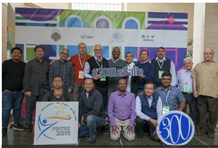
The Intercapital Assembly held in Rome 5-17 March, at the Christian Brothers Generalate.