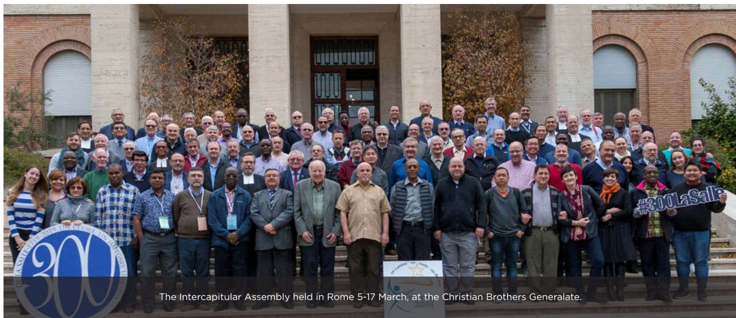
The Intercapital Assembly held in Rome 5-17 March, at the Christian Brothers Generalate.