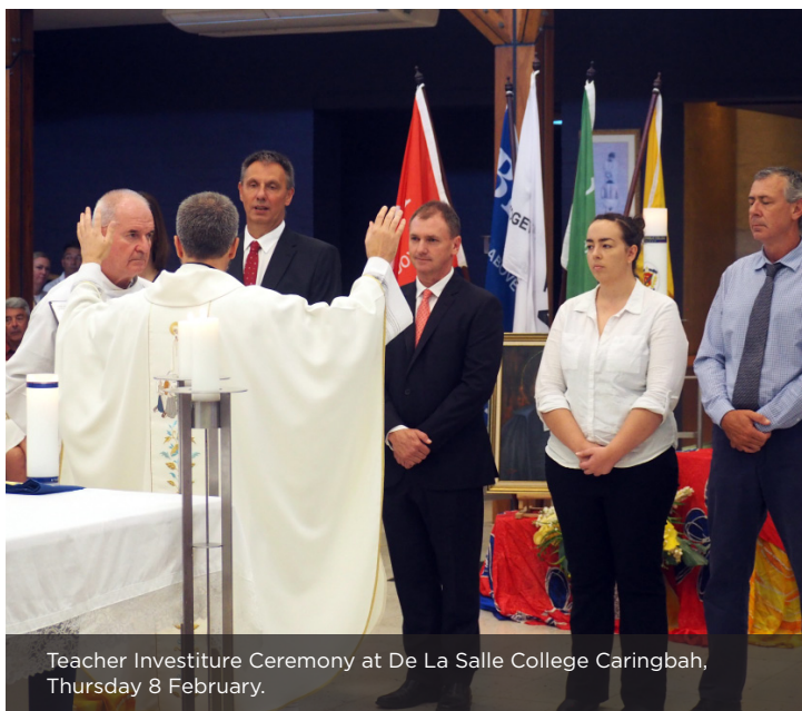
Teacher Investiture Ceremony at De La Salle College Caringbah, Thursday 8 February.