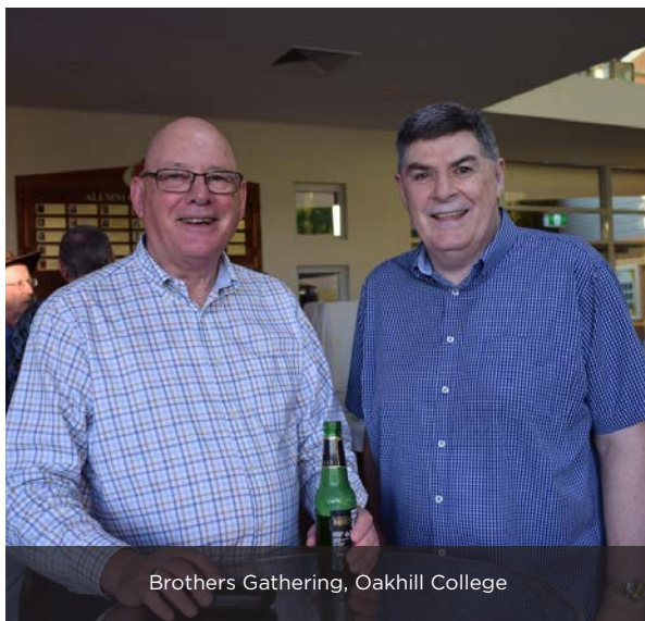
Brothers Gathering, Oakhill College