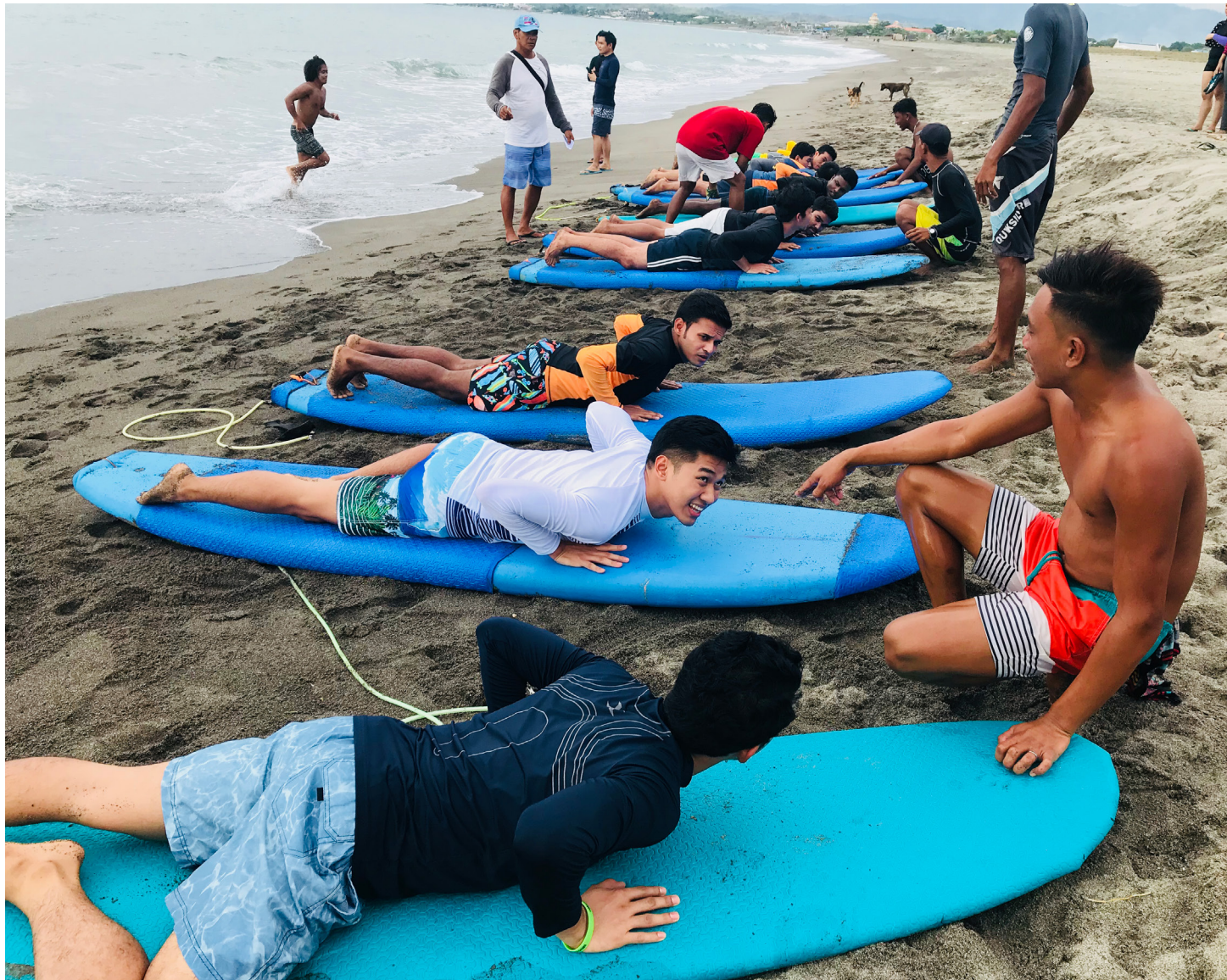
DRY RUN. The novices were given a brief orientation to ensure safety and precaution prior to the actual surfing experience.

The hotel offered beach sports facilities so we decided to play beach volleyball. Although it was only for a very short time, it still added to our fun. Aside from sports activities, we also enjoyed the food served to us. We had our community gathering and socials in a small hut made of hay and bamboo materials. The night came with very clear sky full of stars. The wind was blowing carrying the summer breeze. The vibrant rays of moonshine changed the colors of the sea water. The sound of the sea was dominated by the rushing of powerful waves touching the