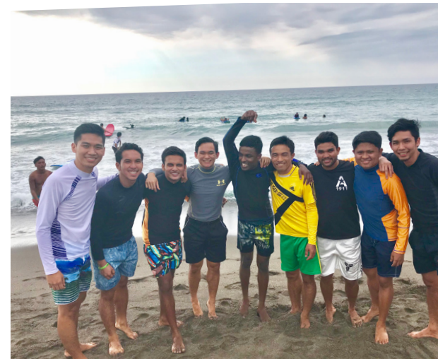
PRE-DEPARTURE. A group photo before the actual surfing adventure.