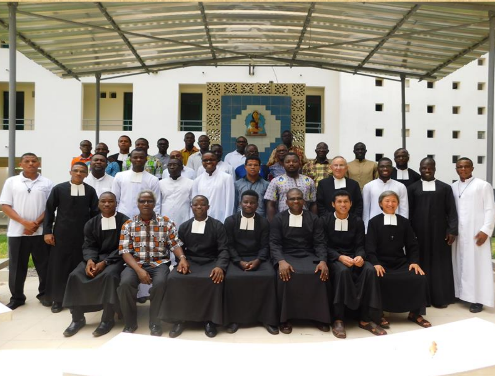
Saint Miguel Scholasticate Abidjan