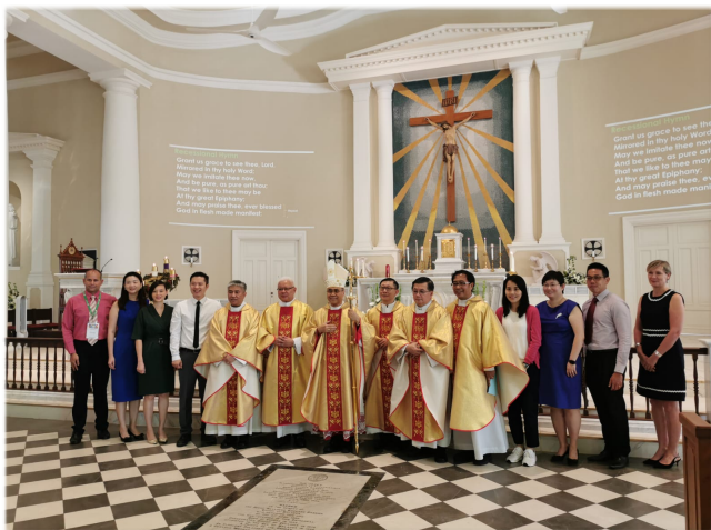
Newly commissioned Catholic principals at the Mass