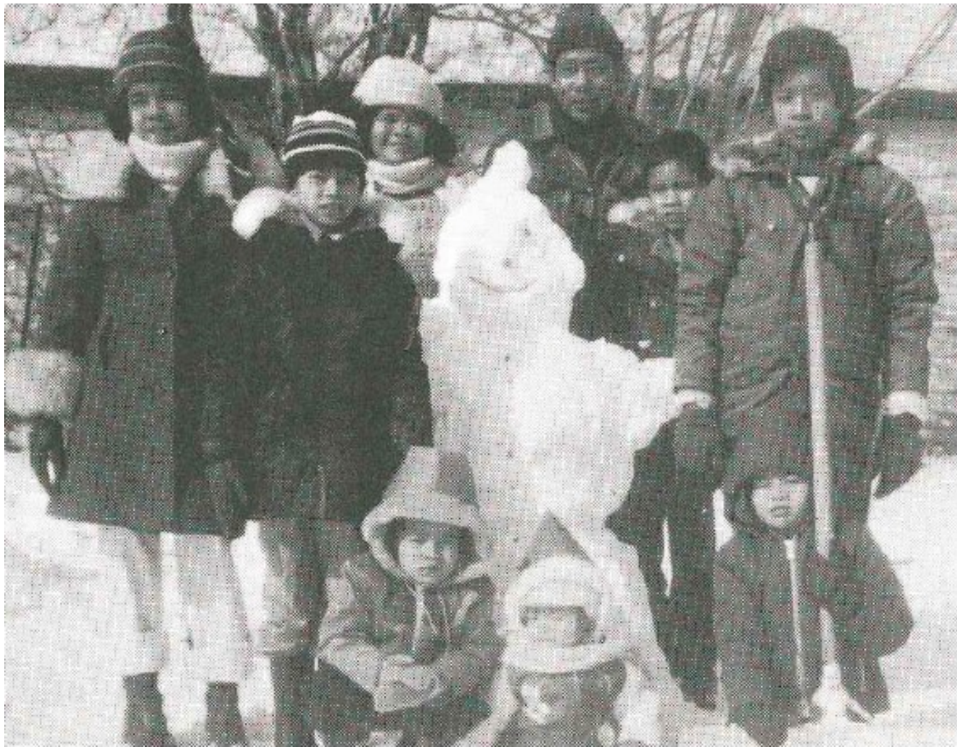
The refugee family from Laos sponsored by the St. Edward’s community