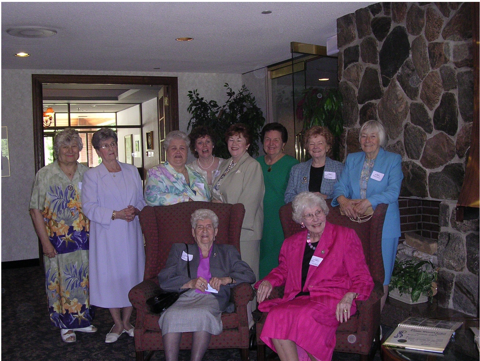
A gathering of CWL members