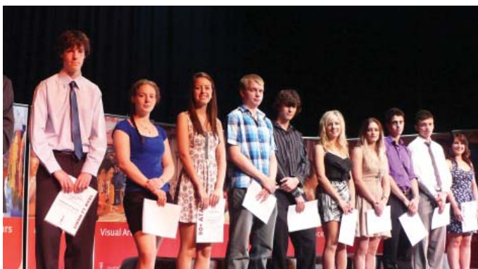
2010 90+ ATAR Award Winners