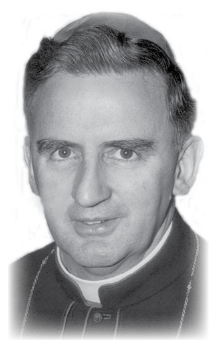
Photo at left: The Official Opening of Gleeson College on 30th July 1989.