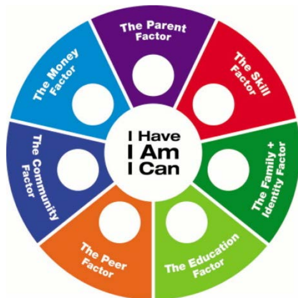
The Resilience Doughnut (image used with permission)