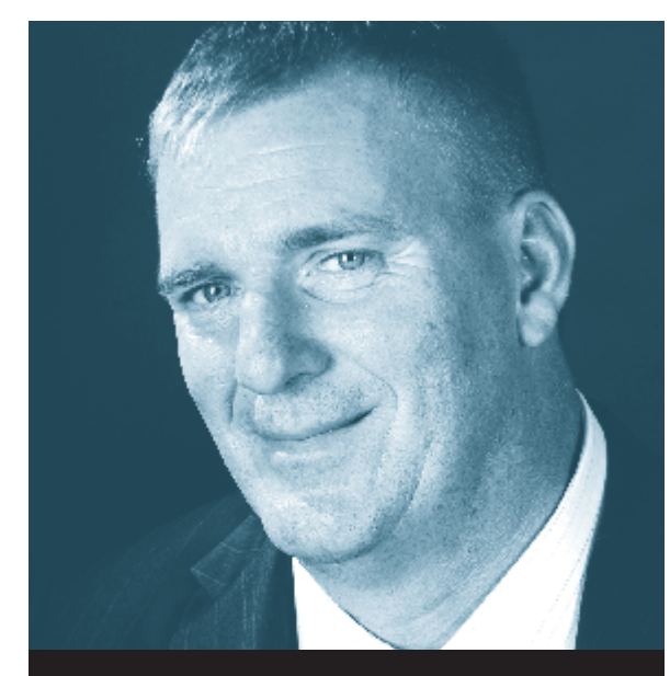
There are about one billion people with disabilities worldwide. They are taking part in the work force at only half the rate of the general population...1.2 million extra Australians could be working and want to work.

Bachelor of Psychology (Marketing) & Master in International Marketing