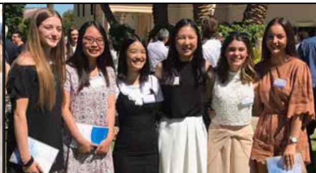
Some of the 2016 Merit Winners at Government House yesterday.