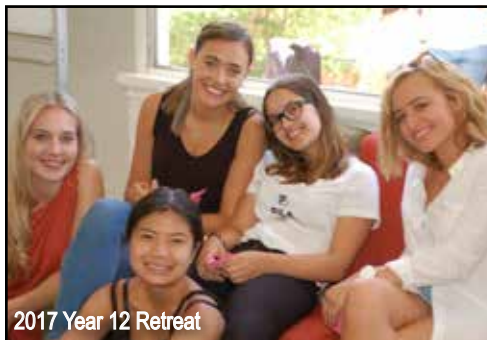
2017 Year 12 Retreat