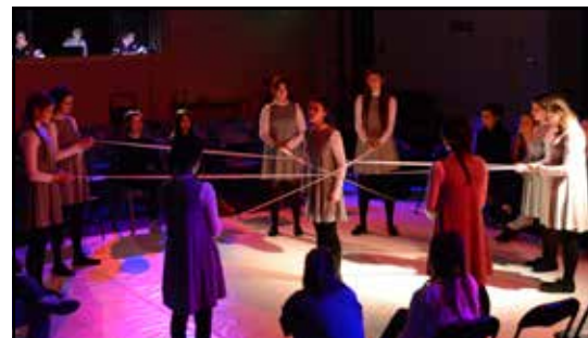
Year 12 performance: 'Eyes to the Floor'

of indigenous families. It was good to see the range of primary and secondary students in their school uniforms from many different parts of Adelaide and beyond.