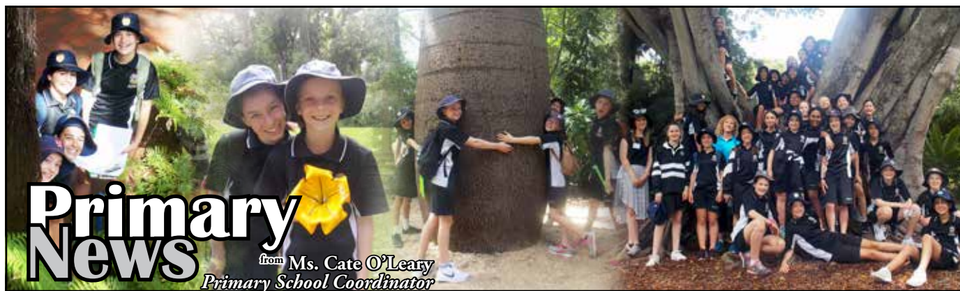
The Year 6 Class visited the Botanical Gardens last week

"A Growth Mindset is not a declaration, it's a journey."