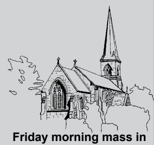
riday morning mass in the Chapel 8.15am

Weds 5 Oct 10:30 - 1:30 Thurs 6 Oct 10:30 - 1:30 Weds 12 Oct 10:30 - 1:30 Thurs 13 Oct 10:30 - 1:30