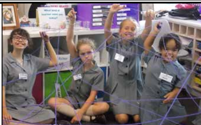
Year 6 gets connected