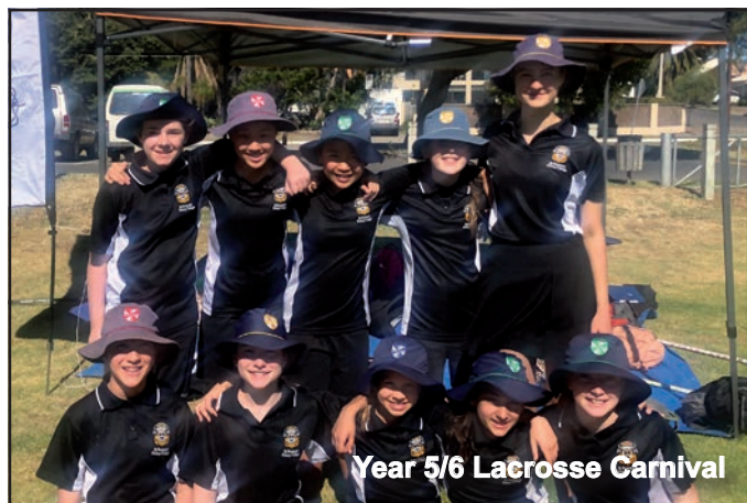
Year 5/6 Lacrosse Carnival

Next week is PE Week and all classes will be involved in active sessions. Please check all notices carefully.