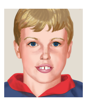
After 6 months: