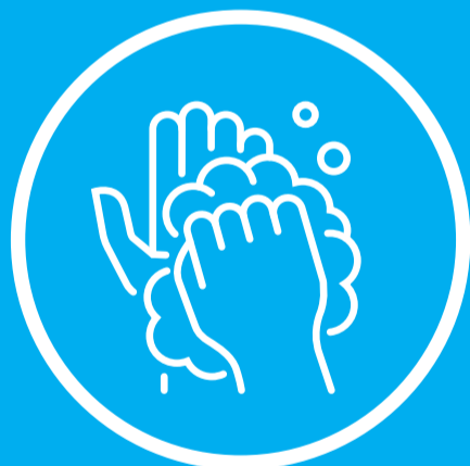
Hygiene and cleaning