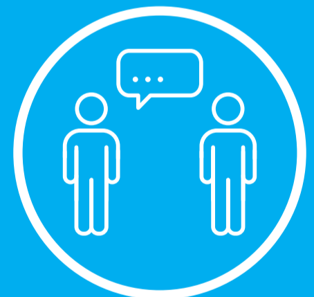
Wellbeing of staff and customers