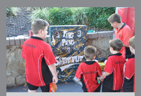
Junior Years students running one of the stalls