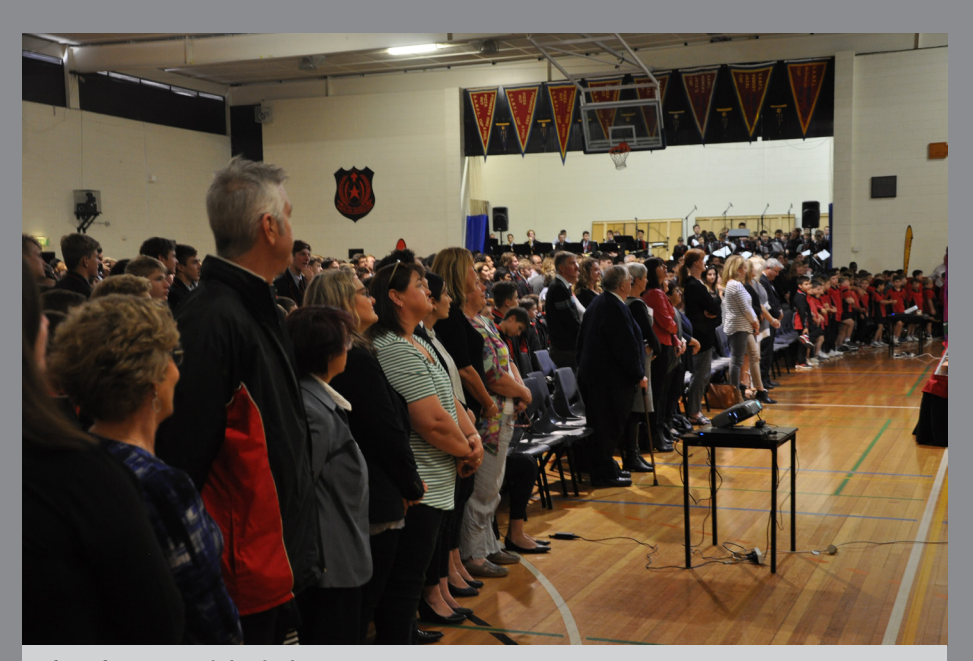
\textbf{\textit{Edmund Rice Day,}} \ \textbf{Whole school mass}