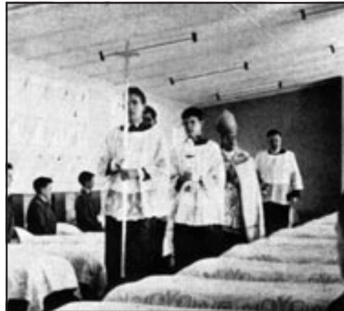
Archbishop Beovich blesses the new dormitories in 1961