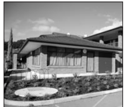
The completed new section of Duggan House, June 2009.