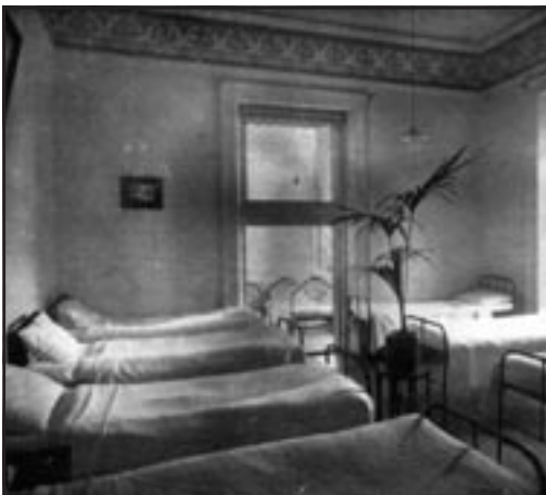
Boarding accommodation was distributed around five large bedrooms in Rostrevor House. This is the Junior Dormitory in 1923.