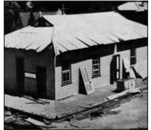
The demolition of the Bungalow in 1961