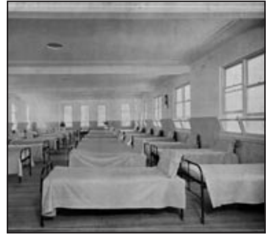
In 1941 a large two-storeyed dormitory block was erected on the northern side of Rostrevor House. The Intermediate Dormitory