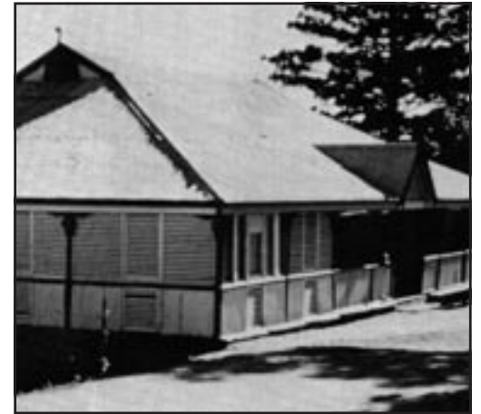
A large bungalow was hurriedly built in a corner of what became known as the 'Bungalow Oval'