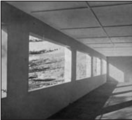
In 1941 a large two-storeyed dormitory block was erected on the northern side of Rostrevor House. The upstairs verandah.