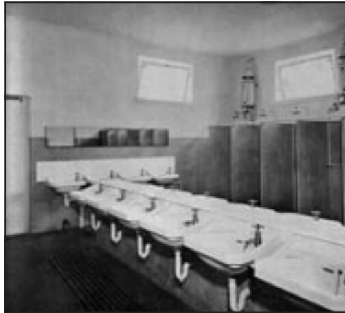
In 1941 a large two-storeyed dormitory block was erected on the northern side of Rostrevor House. The upstairs ablutions area