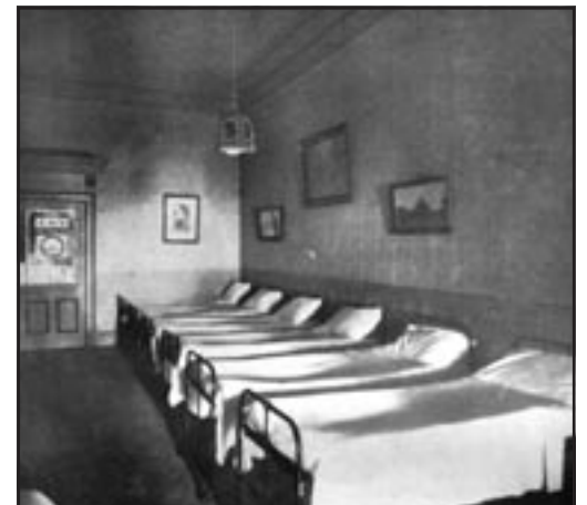
Boarding accommodation was distributed around five large bedrooms in Rostrevor House. The Small Boys Dormitory, 1923