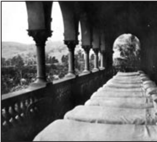
The northern balcony of Rostrevor House (Summer)

large two-storeyed dormitory block was erected on the northern side of Rostrevor House. On each floor was a traditional large room containing forty beds, with ten more on the balcony, a locker room and rooms for the supervising Brothers. The situation remained the same for the next eighteen years, although the old chapel was converted to a temporary dormitory when boarding numbers grew in Brother Mogg's time in the early 1950's to a record 215. A great step forward in the provision of suitable boarding accommodation