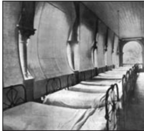
The northern balcony of Rostrevor House (Winter)