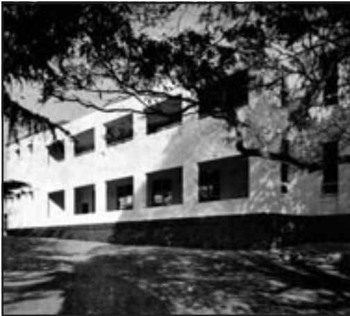
In 1941 a large two-storeyed dormitory block was erected on the northern side of Rostrevor House. The northern exterior of the new Dormitory