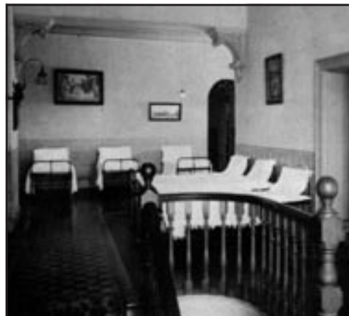
Boarding accommodation was distributed around five large bedrooms in Rostrevor House. This is the upstairs landing in the late 1930s