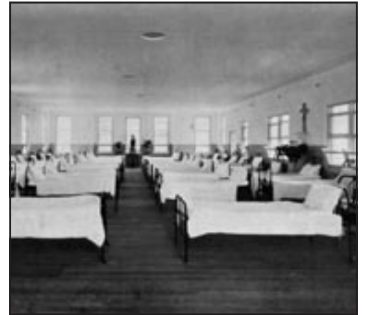
In 1941 a large two-storeyed dormitory block was erected on the northern side of Rostrevor House. The upstairs Senior Dormitory