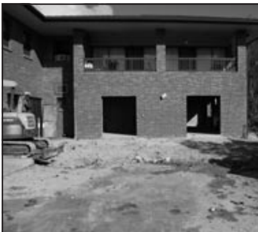
The site for the new Duggan House extension, August 2008.