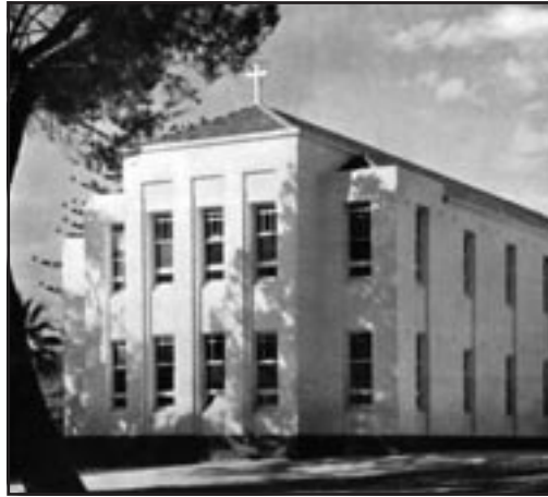
In 1941 a large two-storeyed dormitory block was erected on the northern side of Rostrevor House.