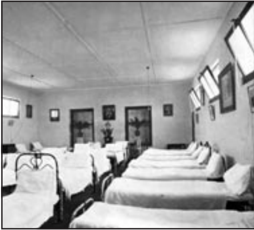
A fine Junior Dormitory was added in 1935.