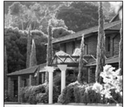
A magnificent modern boarding house was erected on the old tennis courts site. Duggan House, as it was appropriately named, provided excellent accommodation for eighty boarders and live-in staff, ensuring that once again Rostrevor was complete.