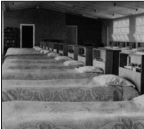
The Year 8 Dormitory in the Rice Wing 1961

The opening of the new section is planned to coincide with the return of the ROCA boarders function, The Boarders' and Scraggs' Banquet on Friday 6 November. See advertisements in this edition for more detail.