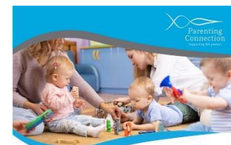
Explore and Play Playgroup FREE 1 HOUR SESSION FOR PARENTS AND CARERS OF CHILDREN 4 - 12 MONTHS