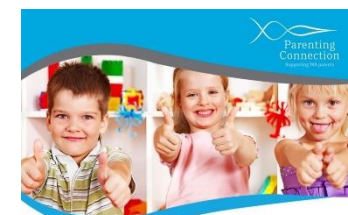
Pyjama Drama A FREE PROGRAM FOR PARENTS AND CARERS OF CHILDREN 2-4 YEARS

Music therapy for young children (0 - 4yrs) and their families. Builds capacity in parents to support their child's development using percussion instruments, drums ribbons, ball and parachutes.