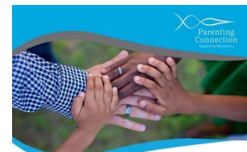
CIRCLE OF SECURITY PARENTING FREE 8 WEEK PROGRAM FOR PARENTS AND CARERS OF CHILDREN 0-5 YEARS

See what it's all about here YouTube Video