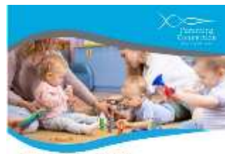
Explore and Play Playgroup A FREE SUPPORTED PLAYGROUP FOR BABIES 4-12 MONTHS