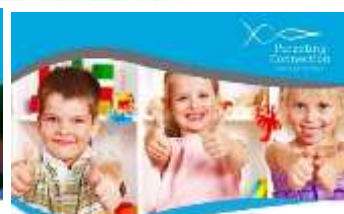
Pyjama Drama A FREE PROGRAM FOR PARENTS AND CARERS OF CHILDREN 2-4 YEARS