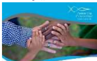
CIRCLE OF SECURITY PARENTING A FREE PROGRAM FOR PARENTS AND CARERS OF CHILDREN 0-5 YEARS