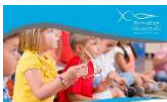
SING AND GROW A FREE PROGRAM FOR PARENTS AND CARERS OF CHILDREN 0-4 YEARS