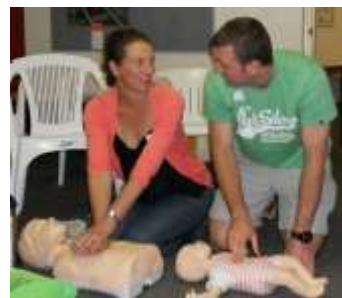
Best Course around Fabulous Reviews