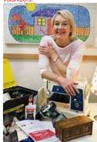
Click to see Repair Shop

A community event by: Transition Town Stirling, Doubleview House and community volunteers.