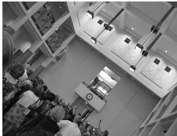
Someone's worst nightmare – Parliament House full of English teachers!