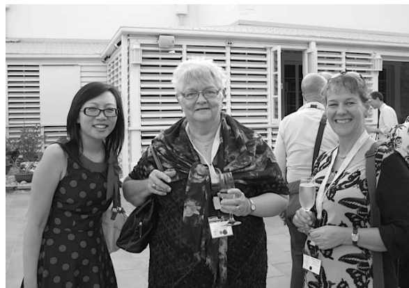
Making new friends