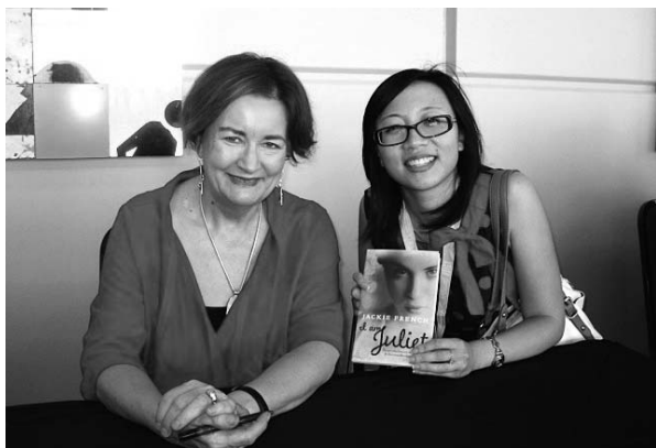
Helping Jackie French launch her new book, I Am Juliet