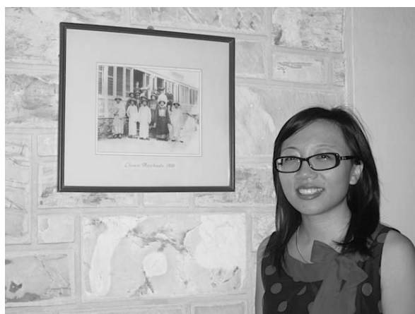
"Feels like home": photograph of my great-grandfather at Government House, 1905

Thank you to ETAQ for this wonderful opportunity. Now I know, because I did go.