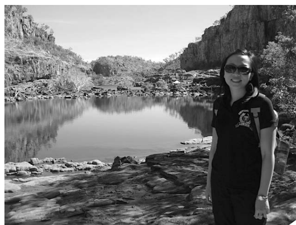
The gorgeous Katherine Gorge

Along the way, I met knowledgeable and enthusiastic historians, other descendants of pioneers and spent happy hours at the Library,