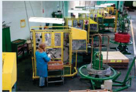
Largest range of MultiSlide Machines