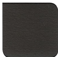
WOODLAND GREY® ①