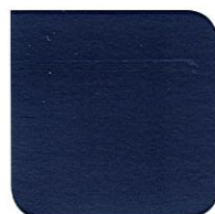
DEEP OCEAN® ②