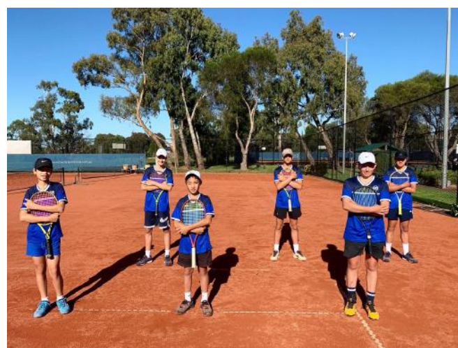
▲ Our 14C Boys – Grand Final winners! Undefeated all season, the team kept up their winning streak, winning 5 rubbers to 1.