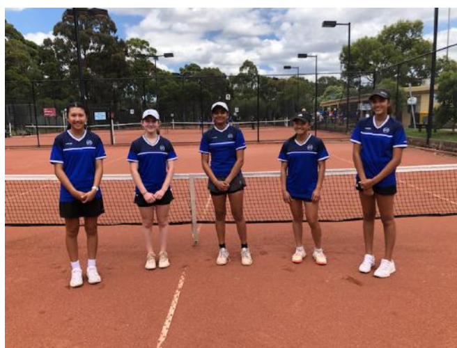
▲ Our 14B Girls – Grand Final winners! The team went through the season defeating all opponents and continued their winning form on Grand Final Day.