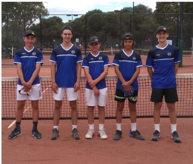
▲ Our 14A Boys – Runners Up! Wearing the Waverley Tennis blue with pride.