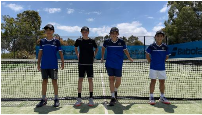
▲ Our 12C Boys – Runners Up! All smiles on this team, showing us good sportsmanship 'til the end.