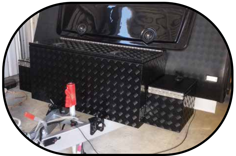
CUSTOM MADE TOOLBOXES