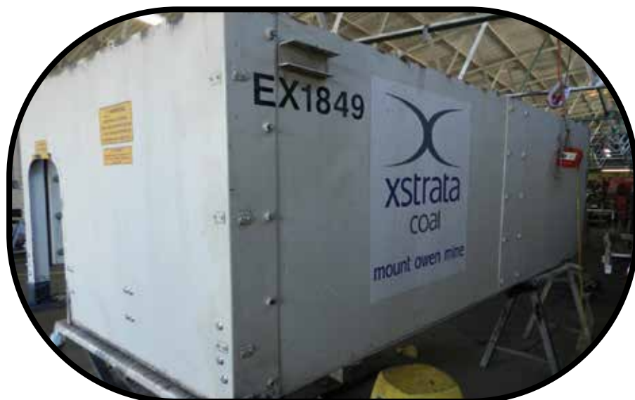
MINING EQUIPMENT MODIFICATIONS