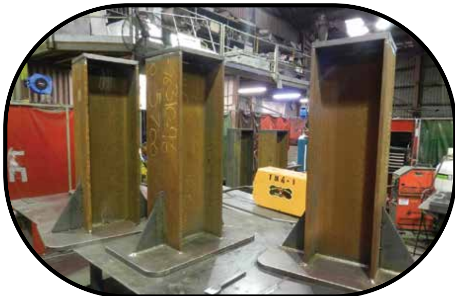
DUMP TRUCK STANDS