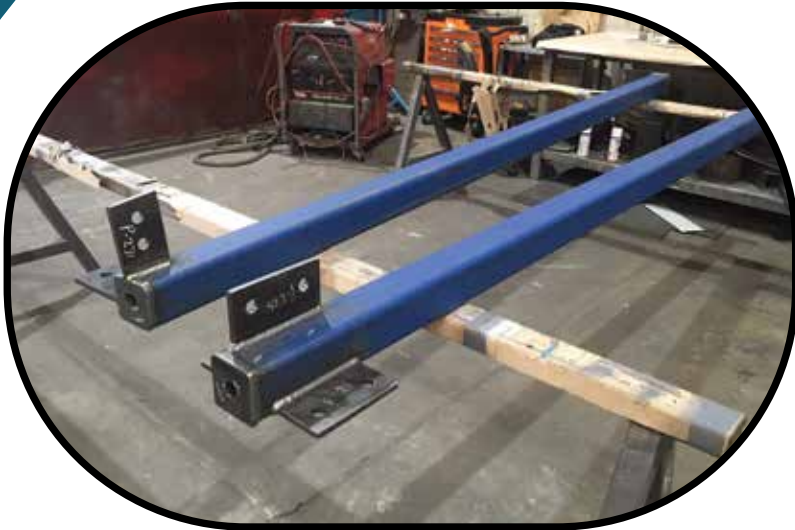
Light structural RHS & beam fabrication.