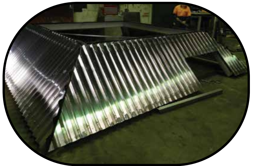
STAINLESS STEEL AWNING