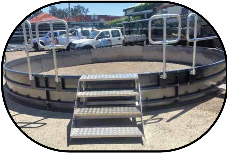
WINDFARM STEEL FORMWORK