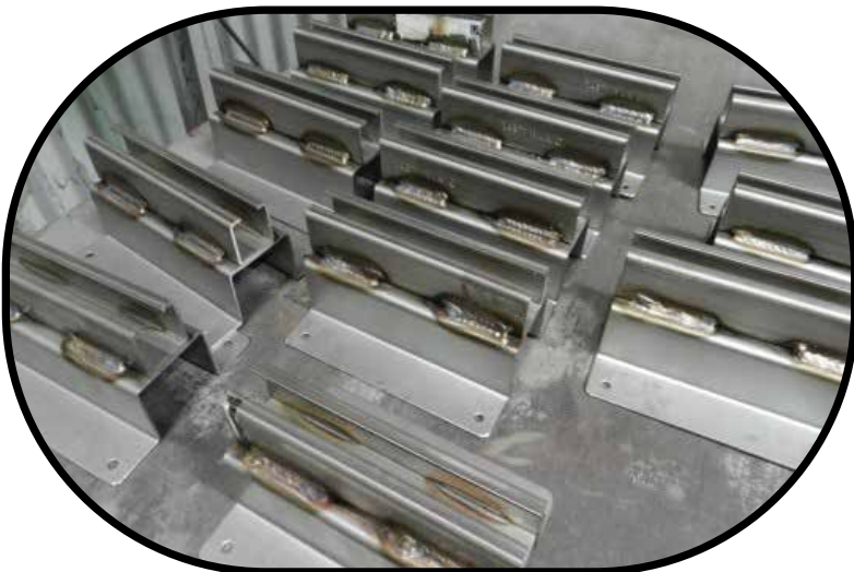
STAINLESS STEEL BRACKETS