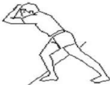
Achilles Tendon Stretch