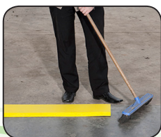
1 Sweep & Clean