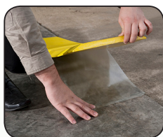
2 Peel & Stick