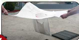
Drain Pollution Guard lowers easily into position.

Is constructed out of geofabric material, fine enough to stop silt, but allows water to flow through. Includes a bilge boom to absorb hydrocarbons.