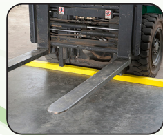
5 Ready for Use!