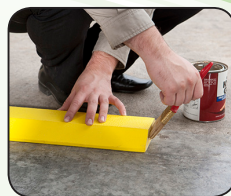
3 Glue Ends