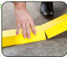
4 Join & Stick