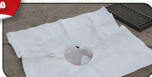
Trim sides after cover is in place.