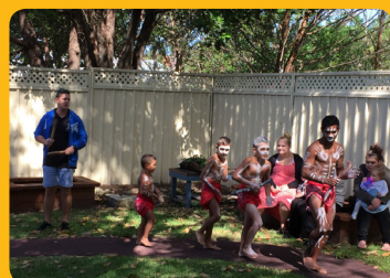
Indigenous Advancement Strategy