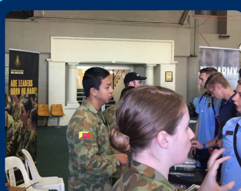
Career & Training Expo