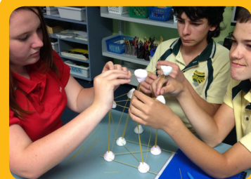
Links to Learning