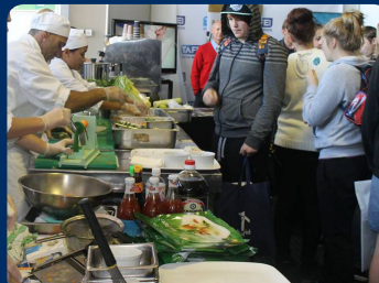
Career & Training Expo