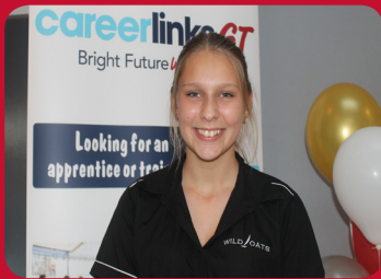
Recruited first SBAT