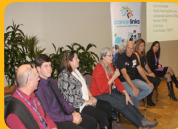
SBAT Info. Night