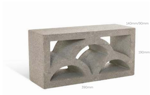
Arches 12.5 units per m 2