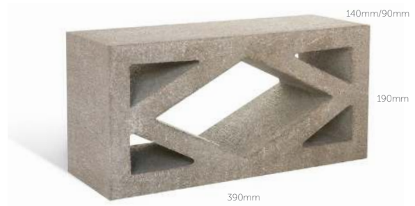
Diamond 12.5 units per m 2