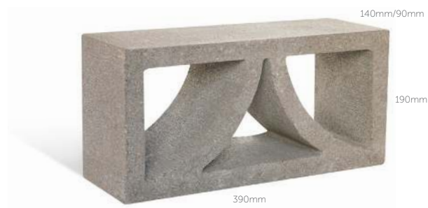
Accent 12.5 units per m 2