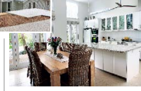
SPACE SHUFFLE... the house was rejigged to create