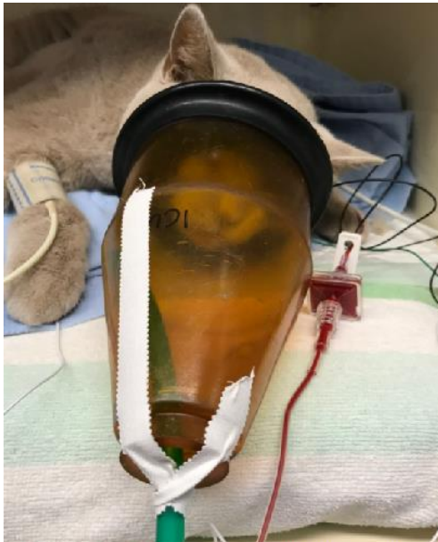
A Cat receiving a blood transfusion. Note the filter is within the line close to the patient

Blood products should always be administered using an appropriate filter to reduce aggregation and microthrombi from entering the recipient's circulation. The filter should be placed in the administration line as close to the patient as possible. The filters in standard fluid therapy giving sets are too small and blood will clot if administered through them. Blood products should not be administered at the same time as fluids containing calcium or glucose supplementation (e.g. Hartmans). Administration rate is determined by the condition of the patient, however we are faced with two conflicting issues. Transfusion reactions can occur from rapid administration, however, if blood products are not administered within a 4 hour period there is a greater risk of bacterial contamination so a balance must be found between the two. Blood can be stored in the fridge for 24 hours so if donated blood is stored in individual syringes, this may be better for patients requiring a slower rate of administration (e.g. patient with concurrent cardiac disease).