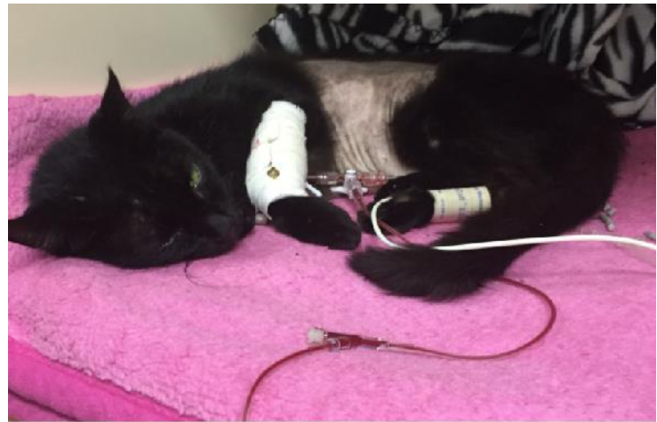
A patient receiving a blood transfusion requires close monitoring

Transfused blood should be administered at 0.5 ml/kg/hour for the first twenty minutes and the patient monitored constantly for signs of a transfusion reaction such as vocalization, tachycardia, vomiting, facial swelling or tachypnoea. After this time the rate may be increased to 1 ml/kg/hr for 20 minutes, followed by 1.5 ml/kg/hr for a further 20 minutes. If there is still no evidence of a transfusion reaction the administration rate is increased so the total volume of the transfusion remaining is administered within a three hour period or faster depending on patient requirements.