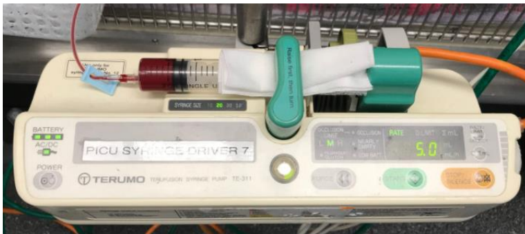
A syringe driver is used to administer the blood transfusion with fine rate control

Should the patient develop mild signs of a transfusion reaction (e.g. mild (1-2°C) increase in temperature, one episode of vomiting) then the transfusion rate should be reduced. If marked clinical signs develop the transfusion should be stopped and the blood replaced with a crystalloid solution. Monitoring of the patient should be continued for evidence of shock or Disseminated Intravascular Coagulation (temperature, pulse rate, mucous membrane colour and systolic blood pressure). The recipient's serum and urine should be assessed for the development of bilirubinaemia and bilirubinuria which may indicate haemolysis of the transfused red cells. Anti-inflammatory doses of corticosteroids (methylprednisolone succinate 20mg/kg IV once) may be administered in conjunction with an antihistamine (diphenhydramine 2mg/kg IV). The blood bag should be assessed by checking a PCV for evidence of lysis and potentially submitting a sample for bacterial culture.