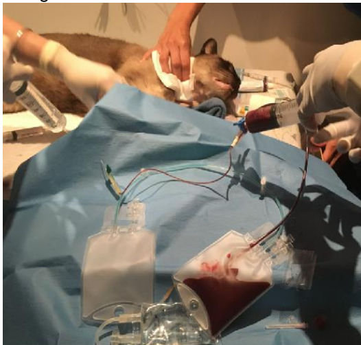
Obtaining a blood donation through a semi closed system reduces the risk of bacterial contamination

Donor selection is extremely important and a list of suitable donor cats should be kept up to date in case of emergencies. The ideal donor is: