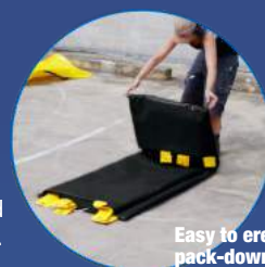
Easy to erect, pack-down, store & transport

SpillSmart lightweight collapsible bunding provides temporary storage of hazardous chemicals and liquids where vehicle access is required. The walls easily collapse and re-erect, and it's easy to transport, store and clean.