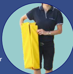
Lightweight and portable

Lightweight and easy to clean, SpillSmart Spillbunds provide spill containment in applications where hydrocarbons or potentially hazardous chemicals/liquids are stored. The flexible side walls allow for simple delivery of liquid storage drums. Made from a strong, chemically resistant and UV stable polymer coated fabric.